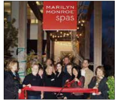
Marilyn Monroe Spas