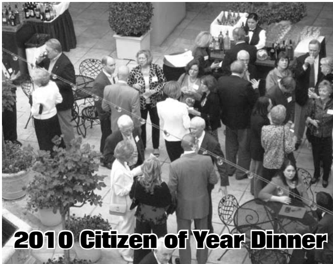
2010 Citizen of Year Dinner