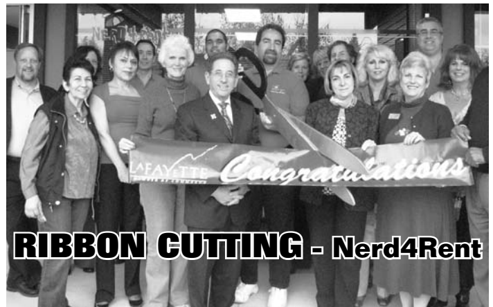
RIBBON CUTTING - Nerd4Rent

During the month we also sponsor the annual Taste of Lafayette. This event allows you to visit between 15-20 restaurants to taste their cuisine. We also provided a wine reception, appetizers, music and a big raffle sponsored by the Lafayette Community Foundation. You can register for the event by using one of the flyers in this mailing or you can visit www.lafayettechamber.org . To view our video, visit http://www.youtube.com/watch?v=r74ISEvnQsI