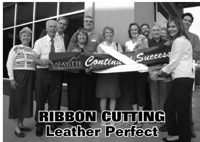
RIBBON CUTTING Leather Perfect

"I attended school at the Academy of Chinese Culture and Health Sciences (ACCHS) in Oakland and received an MS in Traditional Chinese Medicine MSTCM. I am also a Diplomat in Acupuncture from the The National Certification Commission for Acupuncture and Oriental Medicine (NCCAOM). I spent many years doing massage with certificates in Acupressure, Touch for Health, Tui Na, Cranial Sacral and more. I am a member of the California State Oriental Medical Association (CSOMA). I specialize in treating the body as a whole and spends lots of time talking to my patients exploring the mind body connection to see how that might be contributing to their illness."