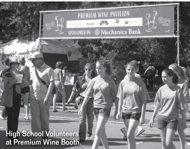
High School Volunteers at Premium Wine Booth.