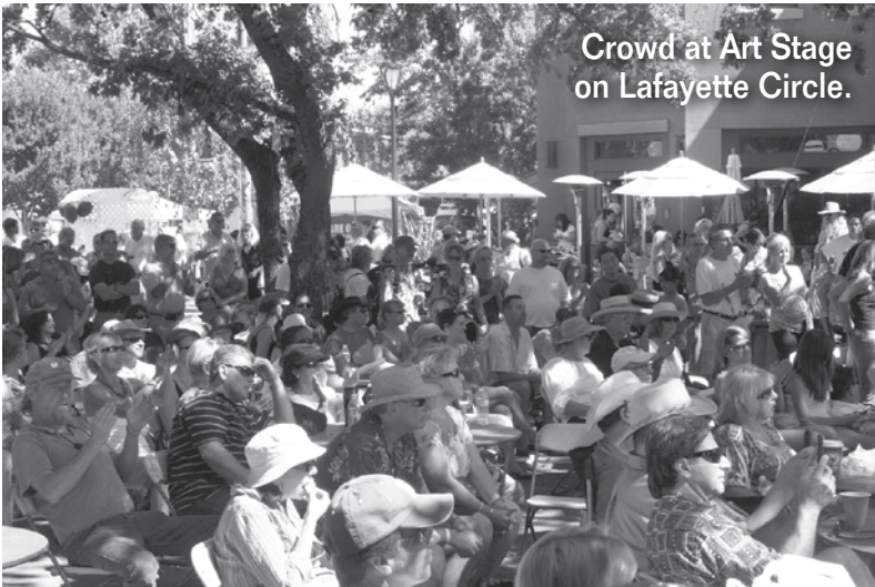
Crowd at Art Stage on Lafayette Circle.