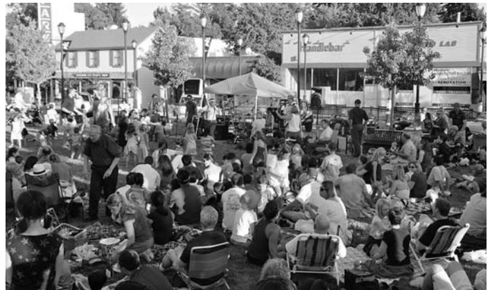
It was a "sold out" crowd at the Plaza Park for the Spazmatics' August 21 performance for the annual "Rock the Plaza" - part of the Chamber's "Try Lafayette First" program.