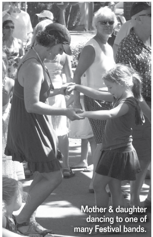
Mother & daughter dancing to one of many Festival bands.