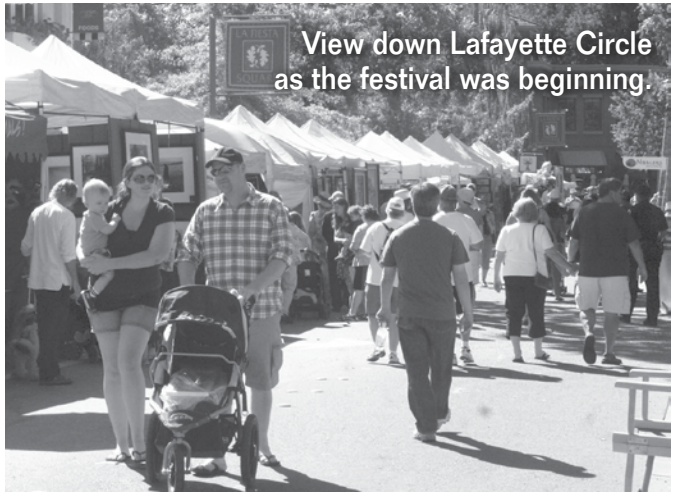
View down Lafayette Circle as the festival was beginning.