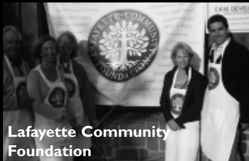
Lafayette Community Foundation