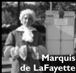
Marquis de Lafayette