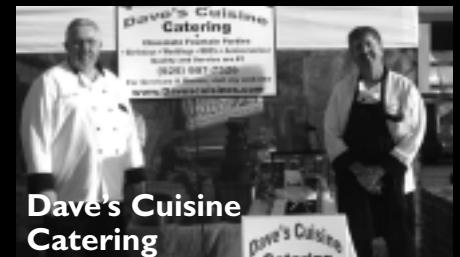
Dave's Cuisine Catering