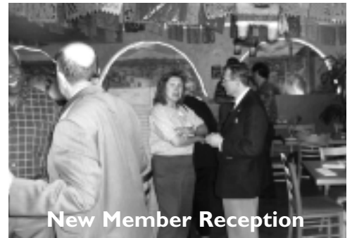
New Member Reception