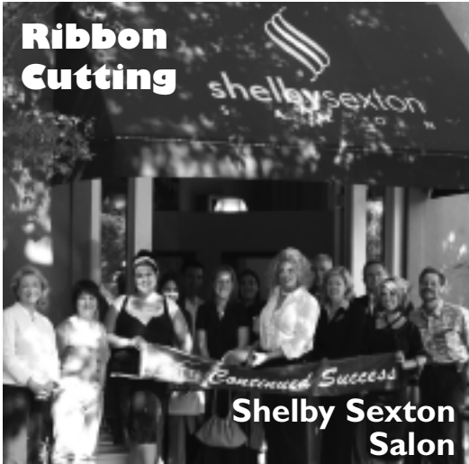
Shelby Sexton Salon