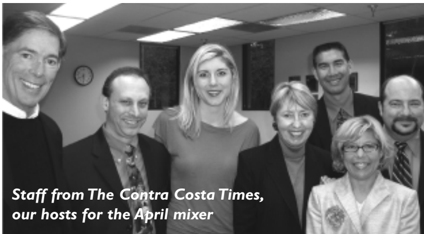
Staff from The Contra Costa Times, our hosts for the April mixer

We packed the lobby at the Contra Costa Times for our April Mixer! Our thanks to the staff at the Contra Costa Times, Susan Foord Catering and the following Lafayette Chamber members who contributed some great raffle prizes: Contra Costa Times, Dudum Financial & Insurance Services, Gold Coin Car Washes, Lafayette Car Wash, Nationwide Mortgage, The Nut Factory, Paychex and Payroll Masters. Our next mixer is on Wednesday, May 10th at Clocks, Etc located in La Fiesta Square. We hope to see you there!