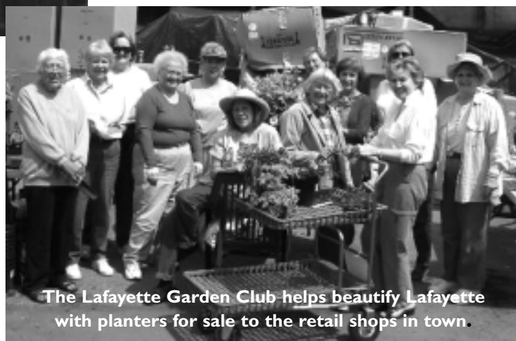
The Lafayette Garden Club helps beautify Lafayette with planters for sale to the retail shops in town.