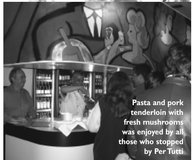
Pasta and pork tenderloin with fresh mushrooms was enjoyed by all those who stopped by Per Tutti