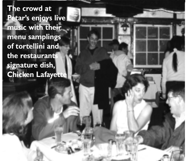
The crowd at Petar's enjoys live music with their menu samplings of tortellini and the restaurant's signature dish, Chicken Lafayette