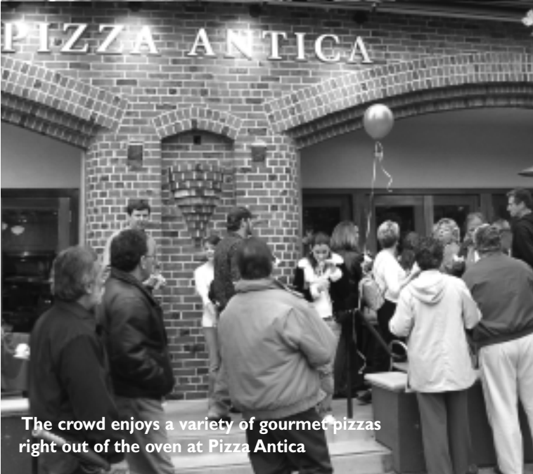
The crowd enjoys a variety of gourmet pizzas right out of the oven at Pizza Antica